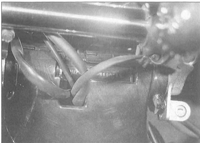
The Vehicle Identification Number (VIN) is stamped into the left side of the steering head