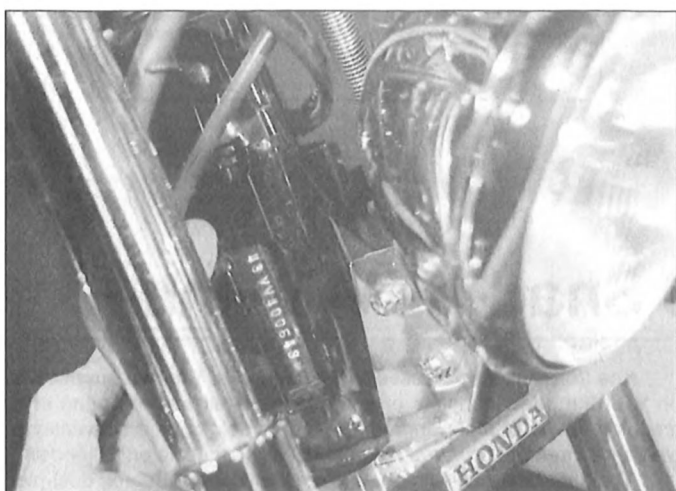
The frame serial number is stamped into the right side of the steering head