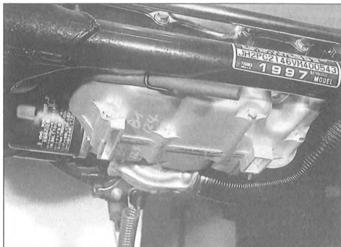
The VIN is also displayed on a label affixed to the right frame rail